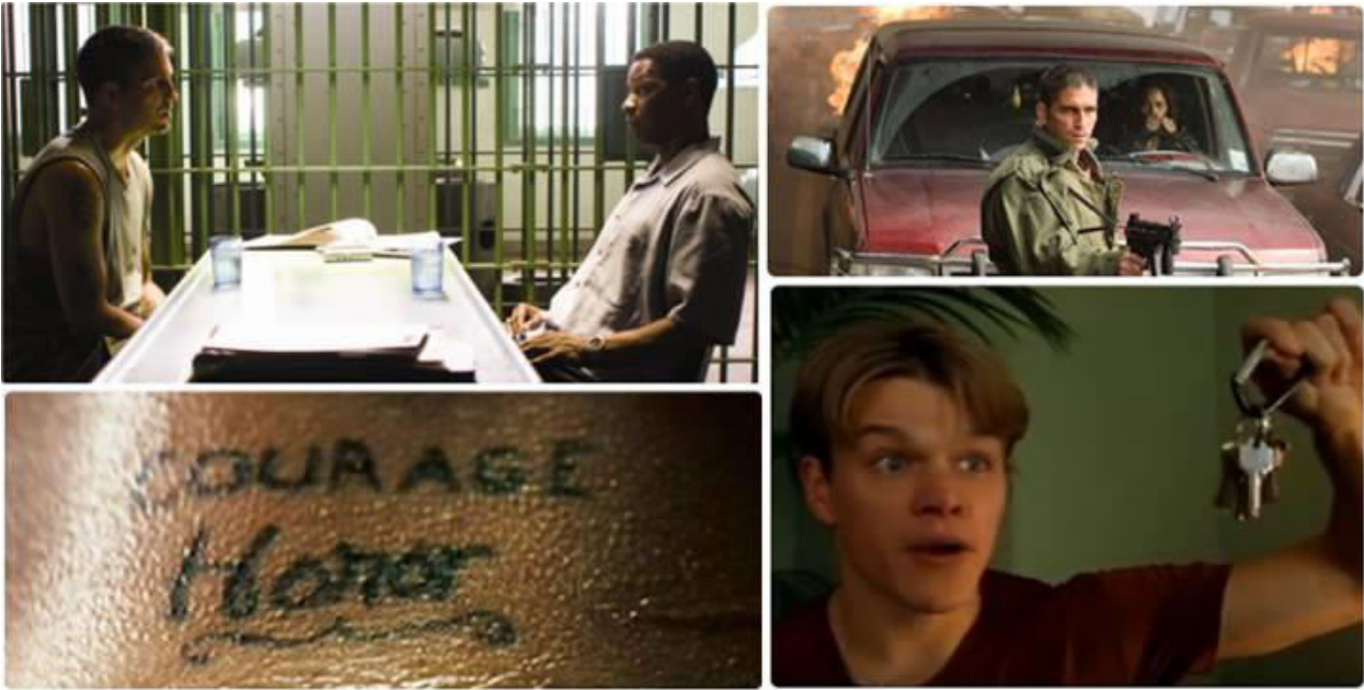
DeJaVu: ATF Agent Douglas Carlin interviews Jim Caviezel; Ferry shootout | Good Will Hunting: Failed therapists Keys clock

The Rock: Stanley Goodspeed interviews Mason promising a 'gift' of an unconditional pardon if Mason helps them enter Alcatraz and disable General Hummel VX gas rockets. Mason responds: 'Beware of Greeks baring gifts'; but he nevertheless decides to accept the offer to help. In the absence of Goodspeed honour; the pardon agreement was meaningless; for those who offered it; had no honourable intention of abiding by their agreement.